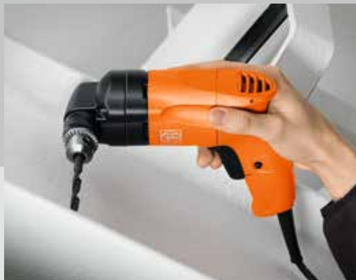
Precise and powerful in tight spaces.

The FEIN angle drill with pistol grip enable problem-free drilling in places other drills can not reach . They have low profile gearbox heads and small widths across corners but powerful motors with speed stability, delivering optimum drilling results.